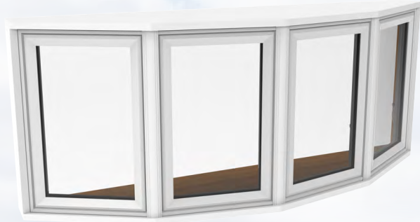
*4 Lite Casement Flankers