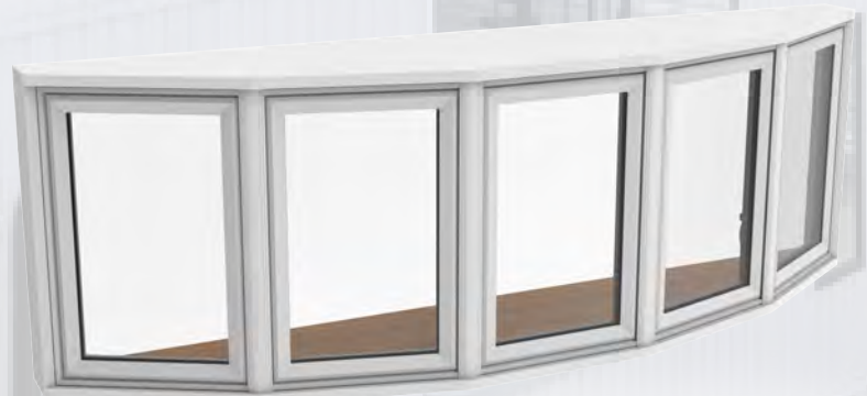
*5 Lite Casement Flankers