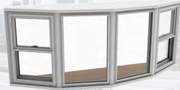
*4 Lite Double Hung Flankers