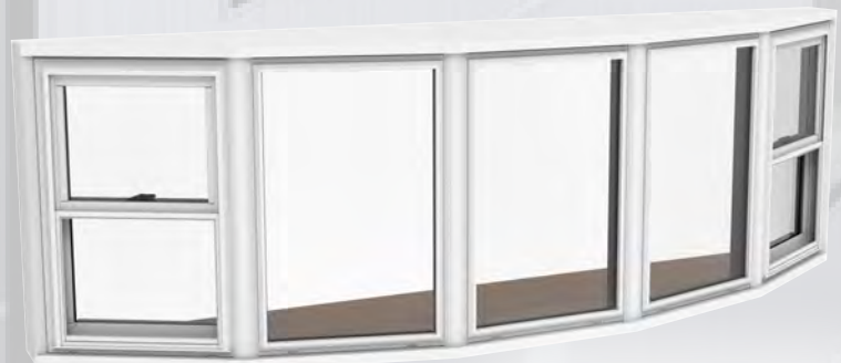
*5 Lite Double Hung Flankers