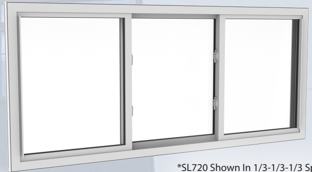
*SL720 Shown In 1/3-1/3-1/3 Spacing*